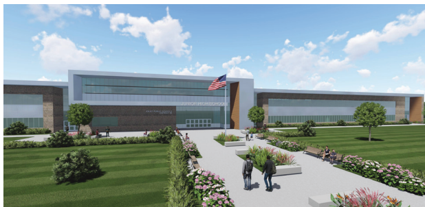
Conceptual Rendering of New Junior High School