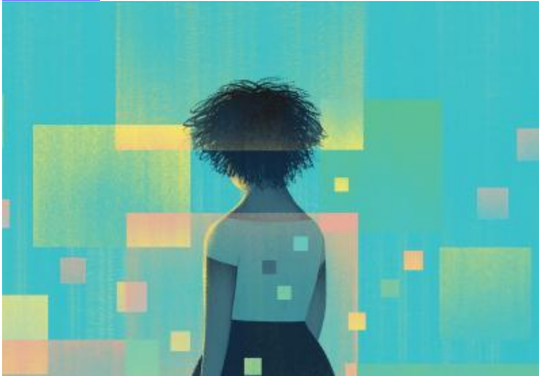
Illustration by Jasu Hu

Web Version: https://www.learningforjustice.org/magazine/summer-2016/teaching-at-the-intersections